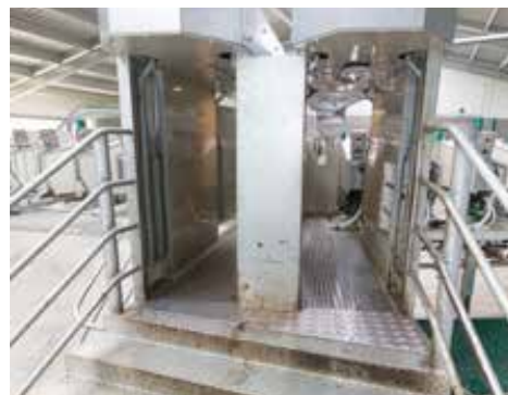
Guided chute for entering the parlour.

The external parlour also comes with a camera and monitor as standard. The camera is situated at cups off and allows the operator to observe animals before exiting. If the goat requires further milking a button push can be easily accessed and prevents the head lock from opening, it will be held in the stall for another rotation, passing the bridge with no interruptions to entering or exiting goats. A second camera can be mounted as an option to observe what is happening in an other area, i.e the yard.