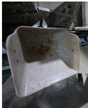
Self emptying feed bins.