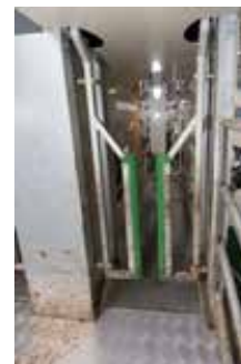
One Way Gates.