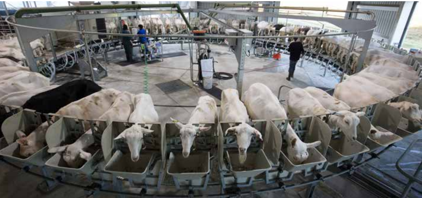
SR Internal Rotary Milking Parlour.