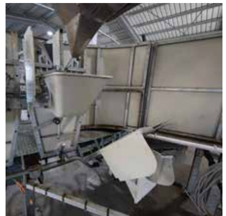
Feed bin and headlock passing under the bridge.