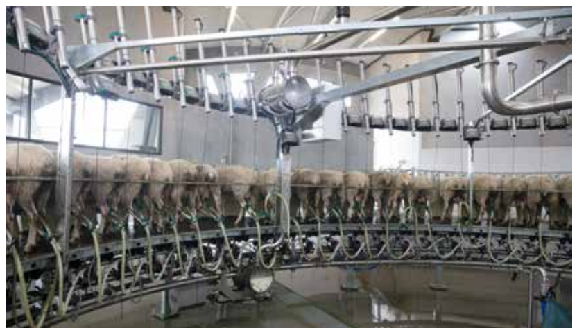
Electronics are mounted on the upper structure to protect from water.