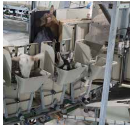
Animals entering the platform.