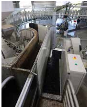
Guided entrance and exit.

When automatic cup removers are installed the milking clusters are suspended from a overhead frame, placing the cluster at the optimal height ready for attachment. At the end of milking the cluster is raised back to position for convenient and quick attachment.